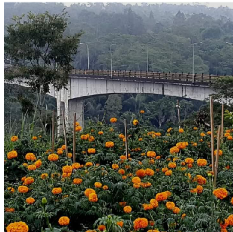
Foto 1. Agritourism of Pelaga and Tukad Bangkung the highest Bridge Southeast Asia

village of Pelaga in the form of a green terraced mountain. The northern boundary of the village of Pelaga is the State protected forest and the Puncak Mangu temple which has panoramic views of rice fields and hills. This study describes the potential market of tourists who have visited the Agrowisata Petang, Badung, and tried to analyze tourist perceptions of the attractiveness of Pelaga Agro Tourism and also analyze the variables that affect them to visit the Agro Tourism Area.