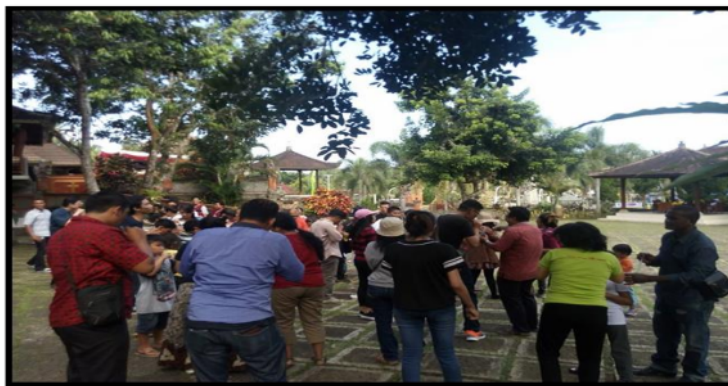
Picture 4.2 Cultural landscape in Blimbingsari Village

Picture 4.1 is the picture of natural landscape of Blimbingsari Village. There are so many trees surrounding the Blimbingsari Village. It was known that village is located in border of conservation area of West Bali National Park. It is useful for walking, biking, jogging and sight-seeing. Garden view: the garden view in Blimbingsari Village is so beautiful. Houses are so nice and diversified here. Besides, the gardens are full of flowers of different kinds which make other people feel so delight while visiting. It is so attractive as if visitors are walking in a very big park not a village anymore. Also, there are some small farms in Blimbingsari Village located within the village turn this place to become a truly countryside with small farms and small forests interpose together. Small lakes as known Taman Grojogan: there are some small lakes where people can go fishing, boating or even swimming if possible. Other site, there are several fields where people can play food ball, camping, and barbecue and do some other outdoor recreation activities. Temperate climate is good weather especially in dry season to do recreational activities.