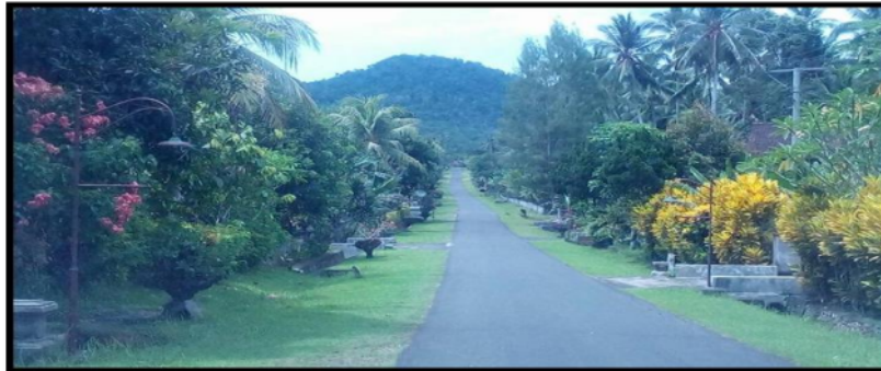
Picture 4.1 Natural landscape of Blimbingsari Village

Picture 4.1 is the picture of natural landscape of Blimbingsari Village. There are so many trees surrounding the Blimbingsari Village. It was known that village is located in border of conservation area of West Bali National Park. It is useful for walking, biking, jogging and sight-seeing. Garden view: the garden view in Blimbingsari Village is so beautiful. Houses are so nice and diversified here. Besides, the gardens are full of flowers of different kinds which make other people feel so delight while visiting. It is so attractive as if visitors are walking in a very big park not a village anymore. Also, there are some small farms in Blimbingsari Village located within the village turn this place to become a truly countryside with small farms and small forests interpose together. Small lakes as known Taman Grojogan: there are some small lakes where people can go fishing, boating or even swimming if possible. Other site, there are several fields where people can play food ball, camping, and barbecue and do some other outdoor recreation activities. Temperate climate is good weather especially in dry season to do recreational activities.