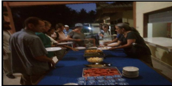
Picture 4.4 the food services in Blimbingsari Village

hiring is available so it's easy for visitors to travel around so the visitors don not have to bring their own bikes on cars.