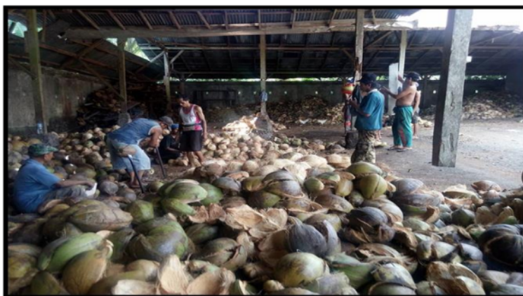
Picture 4.6 the coconut collecting in Blimbingsari Village

Nature landscapes such as forest (West Bali National Park), small lake (Grojogan), man-made lake (Palasari), and plantation can be found nearby village of Blimbingsari Village. The housing and environment naturally surrounding of the village are potential as outdoor recreation spot. Agriculture is the traditional job of the local and in urban tourist eyes it very attractive to them and it offers them a chance to study about agriculture and practice with the farmers. After that they get an interesting experience since they enjoy being a farmer as this always different from their routine jobs.