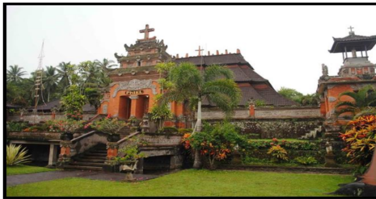
Picture 4.3 the authentic Balinese church in Blimbingsari Village

In the near future, it is suggested that the tourism department and local government in Blimbingsari Village should organize more cultural activities and sport events for the locals as well as tourists. Besides, holiday resort should be built to serve for stressful tourists who are looking for fresh, quiet and beautiful place to refresh. Some of the attraction and activities that the tourists can experience are flora and fauna, planting, forestry, and cultural activities. More over amenities that can also be found which are essential for tourists are:: Hotel or villa, restaurant or food services, shops ready to serve the visitors in Blimbingsari Village. However such amenities and attractions have their own strengths and weaknesses.