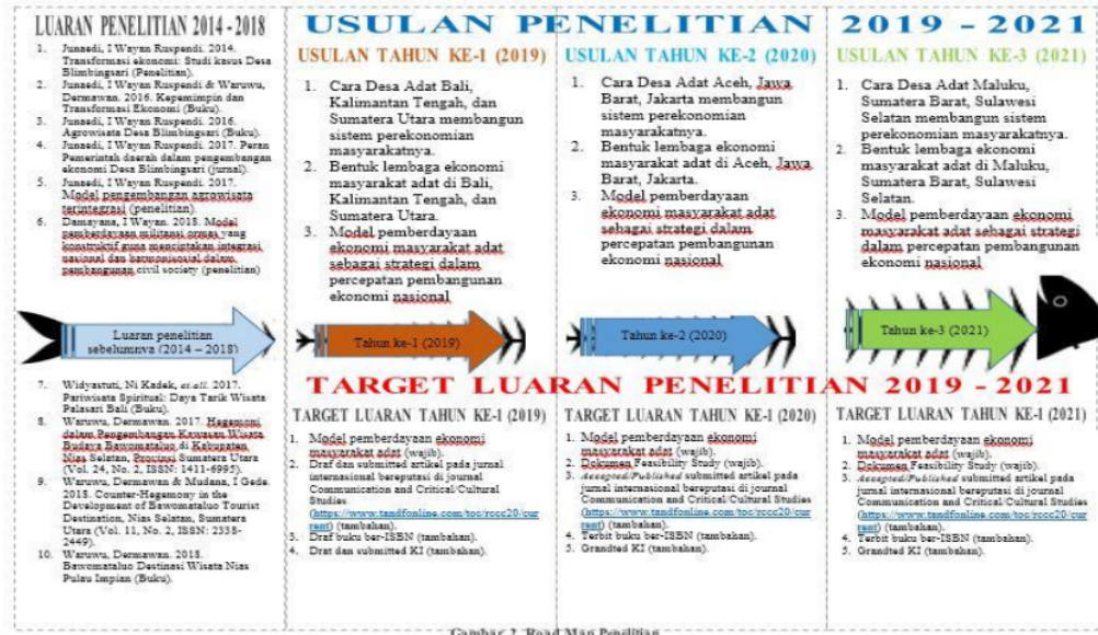
Gambar 2. Road Map Penelitian