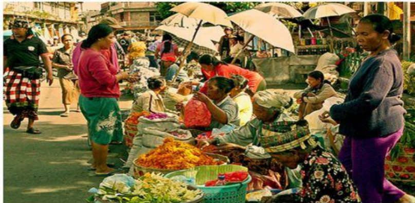
Figure 1. Traditional Market Atmosphere in Bali

In developing the concept of customary economy and its capital, the Bali Traditional Village levies fees on traders who do business in their area. This levy is always done every day or every month. This levy is imposed on all parties, both in the informal sector and the formal sector. One of the traditional markets in Badung Regency, Bali Province, which gives donations every month to traditional officials as shown in Figure 1 below.