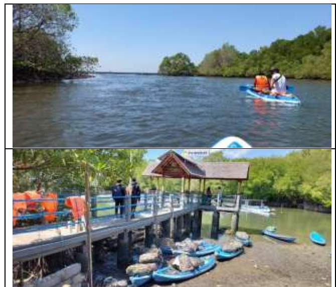
Figure 5. Ecotourism Program of Bali Mangrove (Observation by Utama, et al., 2023).

They can become tour guides, boat managers, or carpenters to build facilities and infrastructure in the area. Revenue from the tourism sector also provides economic benefits to local communities, thus improving their welfare and helping to reduce pressure on the mangrove ecosystem. Overall, the Bali Mangrove Ecotourism Area makes a positive contribution to Bali tourism through the sustainable use of natural resources, the development of education and environmental awareness programs, mangrove conservation efforts, and the empowerment of local communities. These findings are similar to those of previous researchers [23]; [24]; [29]; [27].