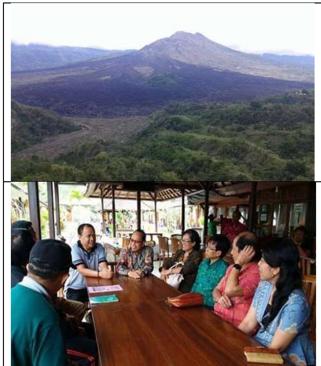
Figure 3. Ecotourism Program in Border of Geopark Batur, Kinatamni, Bali (Observation by Utama, et al., 2023).

The Batur Kintamani Geopark is a new tourist attraction owned by Bali. The museum displays various collections related to the geological, archaeological, and cultural history of Kintamani Bangli. Visitors can see various artifacts, fossils, and volcanic rocks, as well as information about the uniqueness and beauty of the geology around Kintamani Bangli. In addition, the museum also exhibits various cultural objects and community life in the area, such as traditional clothing, and traditional equipment, as well as information about the beliefs and activities of the local community. The Kintamani Bangli Geopark Museum is an ideal place for those who want to learn more about the history and culture of Kintamani Bangli, as well as enjoy the natural beauty presented through the museum's collections. [19].