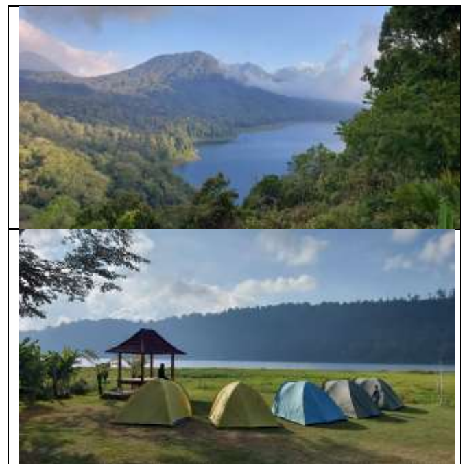
Figure 4. Ecotourism Lake Buyan Tamblingan (Observation by Utama, et al., 2023).

The Lake Buyan and Tamblingan areas are two lakes located in Pancasari Village, Sukasada District, Buleleng Regency, Bali, Indonesia. Both lakes are popular tourist destinations on the island of Bali. Lake Buyan has an area of about 3.9 km 2 , while Lake Tamblingan has an area of about 1.45 km 2 . Both lakes are located side by side and connected by a river. Tourism in Lake Buyan and Tamblingan is very interesting because of its beautiful and natural scenery. The calm lake water and green watercolor amaze visitors' eyes. In addition, the lake is surrounded by hills and lush forests, creating a calm and peaceful feel. Visitors can enjoy the beauty of the lake by renting traditional boats available around the lake. Other activities that can be done in this lake are fishing, traveling around by bicycle or motorcycle, or just relaxing while enjoying the beautiful scenery [9]; [21].