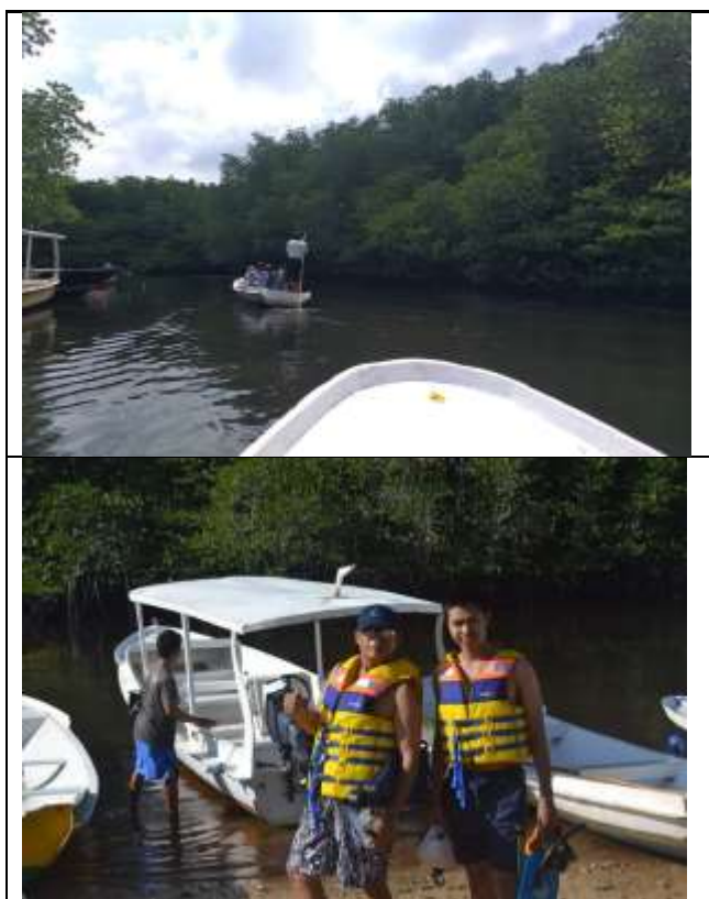
Figure 6. Ecotourism Mangrove at Lembongan-Jungutbatu Village (Observation by Utama, et al., 2023).

Apart from being a tourist attraction, Lembongan Mangrove Ecotourism also plays an important role in mangrove conservation in the area. They actively conduct mangrove seedling planting activities, clean up trash, and educate the community and visitors about the importance of maintaining the sustainability of the mangrove ecosystem. So, for visitors who are interested in nature and want to learn more about mangrove ecosystems, Lembongan Mangrove Ecotourism Klungkung can be an interesting choice [30]; [27].