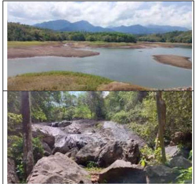
Figure 2. Ecotourism Program of Blimbingsari, and Ekasari Village in Border of West Bali National Park (Observation by Utama, et al., 2023).

Visitors can directly see the process of breeding and releasing turtles into the sea. This is an important conservation effort in maintaining the turtle population in this region. West Bali National Park also has some interesting trekking trails, such as the Sumber Klampok Trail which leads to a lake in the forest, or the Segara Kembar Trail which leads to a white sandy beach. With its unspoiled natural beauty and biodiversity, West Bali National Park is a popular tourist destination for nature lovers and ecotourists in Bali [13]; [14]; [15].