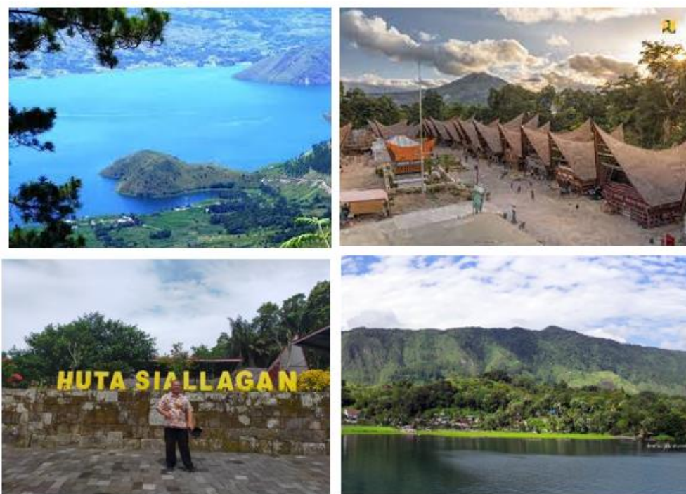
Figure 2. Natural Potential of Siallagan Village

The development of the tourism and ecotourism sector in Siallagan Village will also have a positive economic impact. This will create new job opportunities for the local community, increase the income of traders and business actors around the village, and introduce local cultural heritage and traditions to tourists. In addition, the development of sustainable tourism and ecotourism will also help preserve nature and biodiversity, protect the environment and ecosystems. By wisely utilizing its natural potential, Siallagan Village can become an attractive and sustainable tourist destination, provide economic and social benefits for the local community, and help preserve the natural beauty and existing biodiversity.