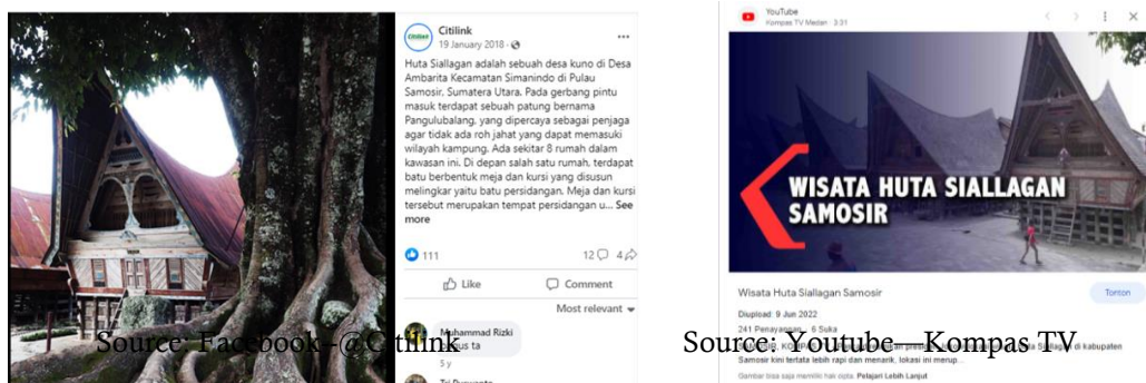
Figure 5. Forms of Siallagan Village Promotion on Social Media

Fourth, trainings were provided to tour guides, tour operators, and tourism managers in Siallagan Village. This training aims to improve the quality of service and tourist experience for visiting tourists. Tour guides are trained in knowledge of tourism objects, local history and culture, as well as communication skills to provide accurate and interesting information to tourists. Tourism actors, such as souvenir traders and local artisans, are given training in producing quality products and keeping abreast of developing market trends. In tourism managers are trained in destination management, financial management, marketing, and management of tourism sustainability. With this training, it is hoped that the service and experience of tourists in Siallagan Village can be improved, giving a positive impression and encouraging repeat visits. However, in the process of developing tourism in Siallagan Village, there are still obstacles to be faced. Some of the obstacles that arise include the limited human resources with specific skills in the tourism industry, limited budget for the development of infrastructure and supporting facilities, as well as challenges in promoting Siallagan Village as an attractive tourist destination among local and international tourists.