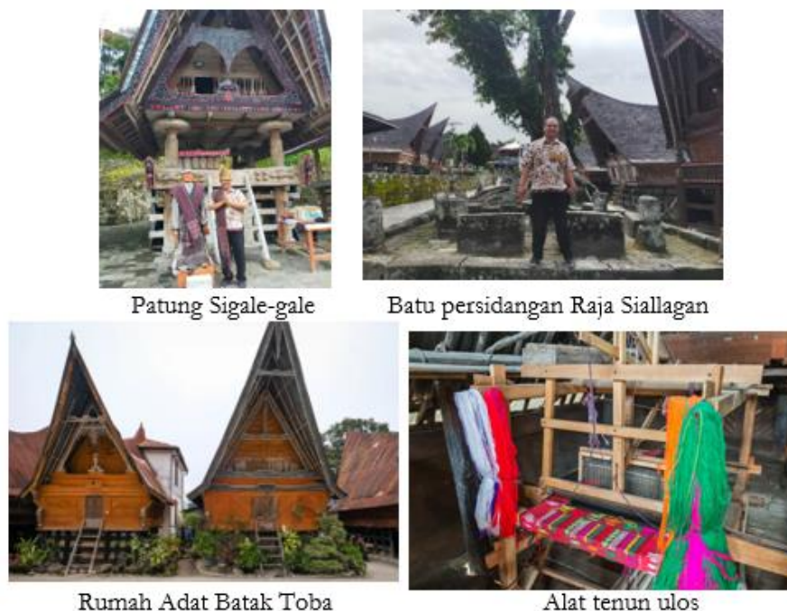
Figure 3. Cultural Potential of Siallagan Village

Toba Batak traditional houses are built on stilts with soaring roofs that symbolize three different worlds in Batak cosmology. The lower part of the house represents the underworld (banua toru) where demons live. The middle part symbolizes the middle world (banua tonga) where humans live and live a household life. The upper part symbolizes the upper world (banua giriang), which is designated as an ancestral place that protects human life. The lower part consists of a 1.5 meter high wooden structure which rests on a flat rock, and is used as a kiosk and storage room. The living room consists of one large open space and is inhabited by four families who are related by blood. Each family gets a certain area in the house, and the center of the house is defined as the passage for everyone.